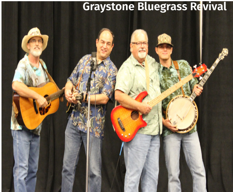
Graystone Bluegrass Revival