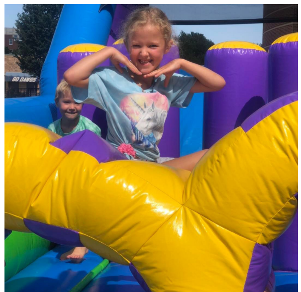
Children of all ages had a great time in the kid's area. story cont'd on page 3