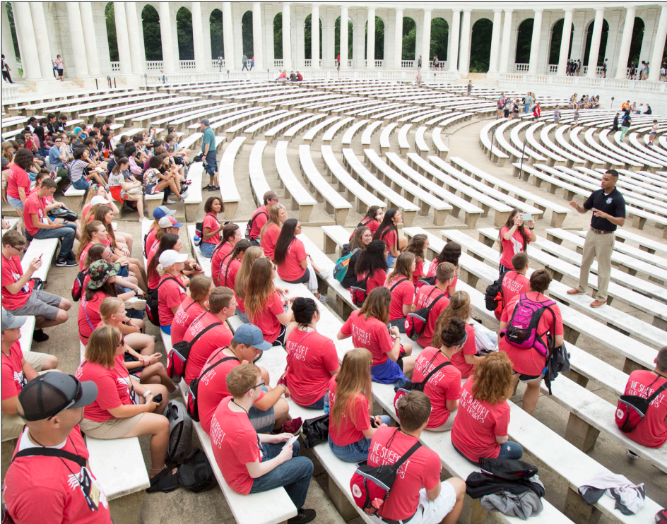
2018 Youth Tour participants listen to a speaker outside the Tomb of the Unknown Soldier.

F or many teens, the Rural Electric Youth Tour is full of “firsts.” It may be the first time they left the state, flew on a plane, visited the nation’s capital or have been away from their family for an extended period of time. Even more are seeing and experiencing the larger world through their own eyes, rather than through their parents’ perspective. That’s the most important first, as it’s truly a “leap” to their next phase and where their journey to adulthood begins.