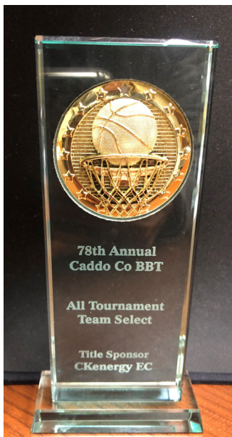
All Tournament team trophies were presented and provided by CKEnergy Electric Cooperative.

designed to teach youth about electrical safety, leadership, and the cooperative world. Not only have we made an investment in our members, but we have expanded that investment to include the youth of our service area through donations, sponsorships, scholarships, and leadership programs. We take commitment to our community seriously; in fact, it is one of the 7 principles we are founded on.