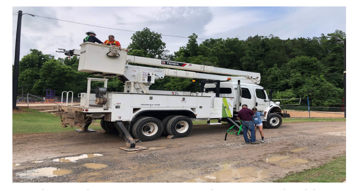
CKEC lineman Billy Patterson and apprentice Hagan Hedrick giving bucket truck rides.

Students enrolled in the eighth grade within CKEC's service territory are eligible to compete for a spot at Youth Power Energy Camp.