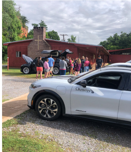
Electric vehicle demonstration

high-voltage demonstration, and learn about electric vehicles and electric bikes. The students take home a new found confidence and a host of new friends-like minded peers from all over Oklahoma.