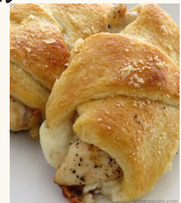
Parmesan Chicken roll-ups

Heat the oven to 375 degrees and spray a cookie sheet with cooking spray. Season each side of chicken with salt and pepper and melt 2 tablespoons of the butter in a skillet over medium high heat on the stove. Cook the chicken for about 10 minutes until each side is nicely browned, and set aside. In a small bowl, mix together the mayonnaise and 1/4 cup of parmesan cheese. This will serve as a wonderful coating for the chicken to give it an extra kick of flavor. Unroll each triangle of crescent rolls and place one piece of chicken at the wide end of each one. Spread a good layer of the mayonnaise mixture on top of each piece of chicken. Divide the mozzarella slices in half to create 8 slices, and add to the top of each piece of chicken. Roll the crescent dough around each piece of chicken and place on the prepared cookie sheet. Melt the remaining tablespoon of butter in the microwave and brush over the tops of each crescent roll. Then sprinkle each roll-up with the remaining grated parmesan cheese. Bake for 14-15 minutes or until the roll-ups are golden brown. Serve with warmed marinara sauce. Enjoy!