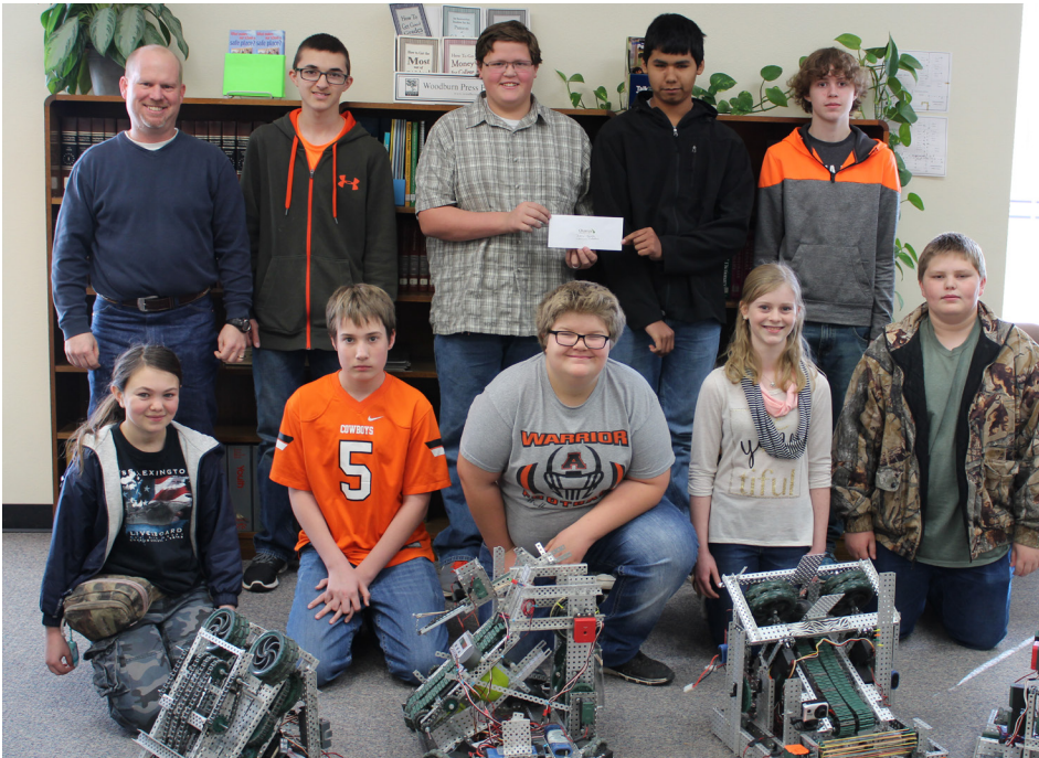
Operation Round Up helps groups, like the Boone- Apache Schools Robotics team, fund their programs and keep students engaged in extra curricular activities.