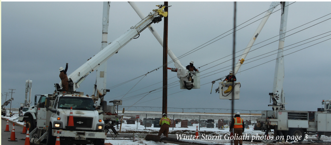
Winter Storm Goliath photos on page 3