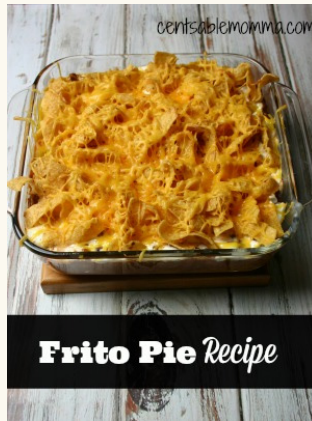
Frito Pie Recipe