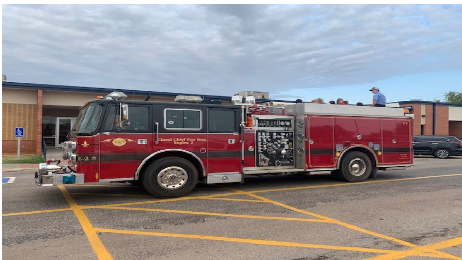
Cloud Chief Fire Department