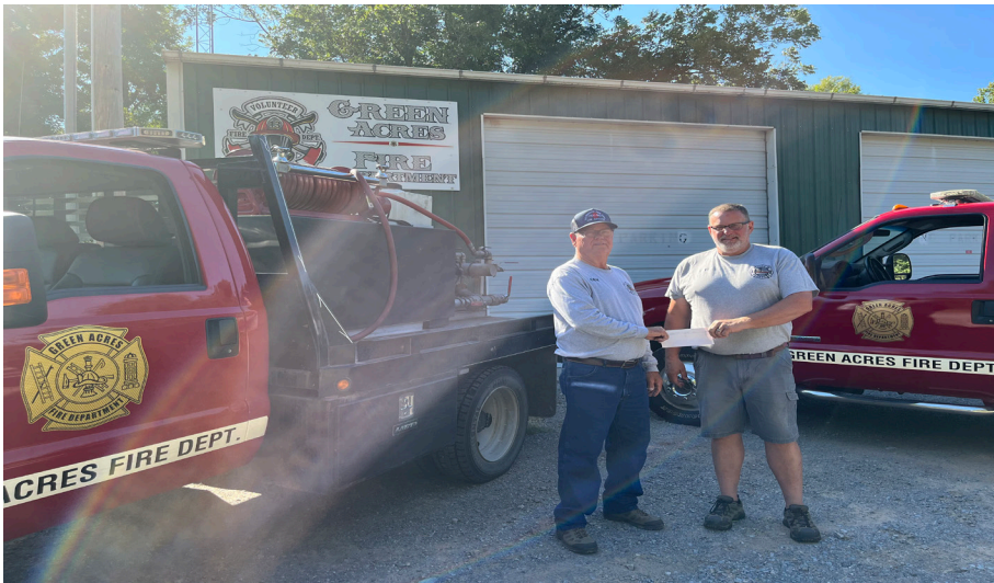
Green Acres Fire Department