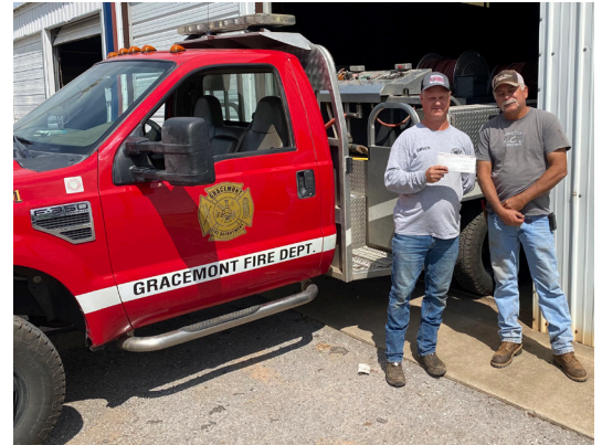
Gracemont Fire Department