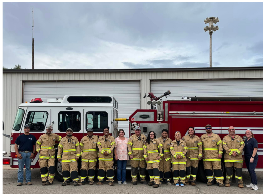
Eakly Fire Department

Pictured are a few of the fire departments that received the donation.