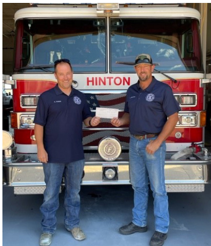
Hinton Fire Department

CKenergy is an equal opportunity provider and employer.