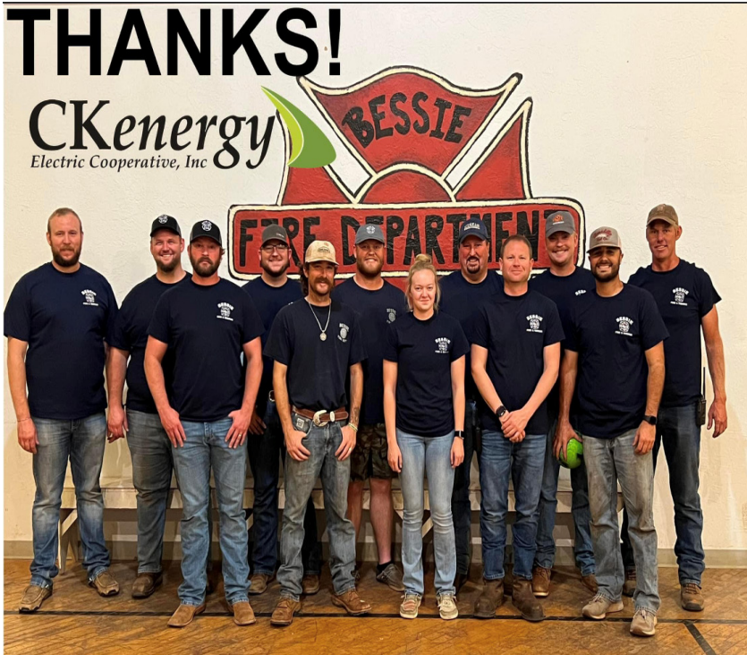
Bessie Fire Department