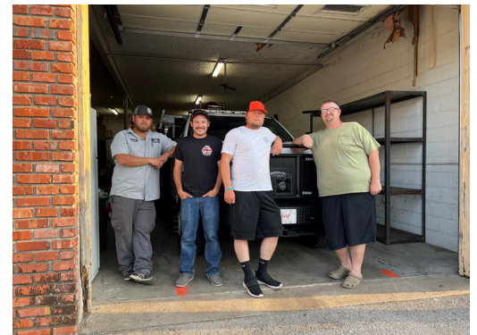
Apache Fire Department

CKenergy is thankful for the fire departments located within our service territory. We appreciate all you do to strengthen our communities and protect those in need. Firefighters respond to hundreds of calls per year within our communities. We value your commitment to serve our members and communities and save lives, homes, and businesses.