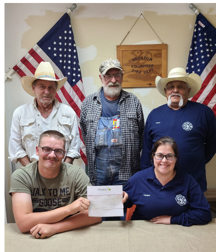
Broxton Fire Department