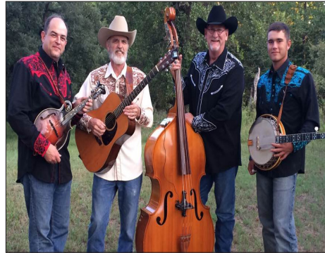
Graystone Bluegrass Revival