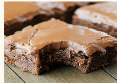
lunch lady BROWNIES

1/4 cup butter, softened 1/4 cup milk ( I use 2%) 1/4 cup unsweetened cocoa powder 3 cups powdered sugar