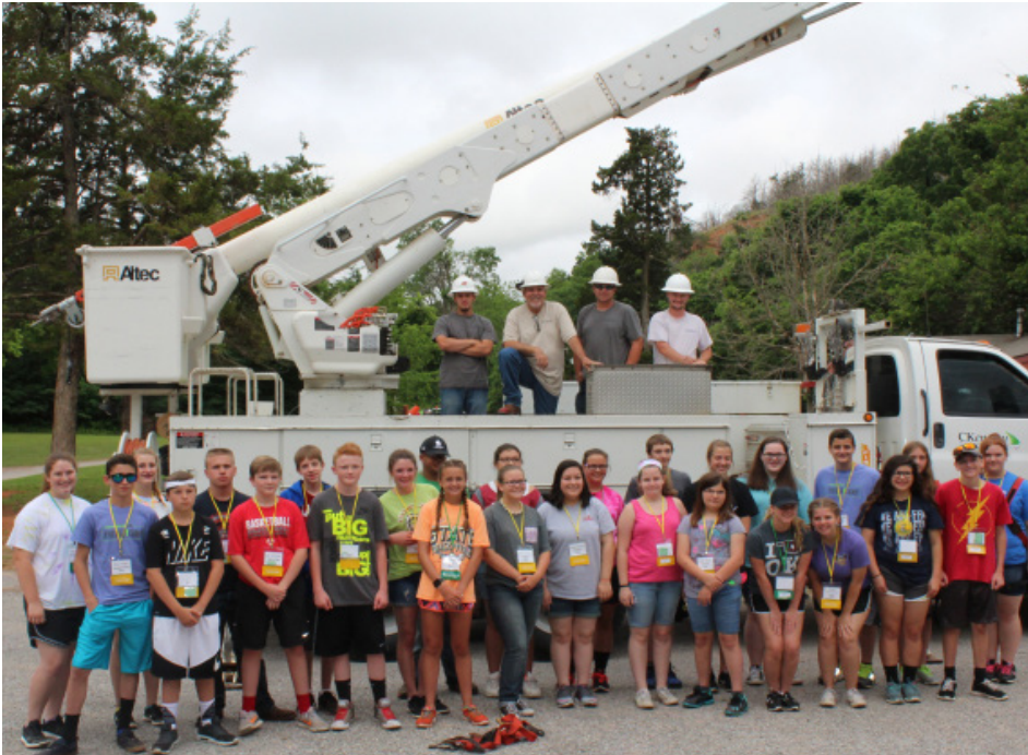
Teens from across the state attend Energy Camp every year