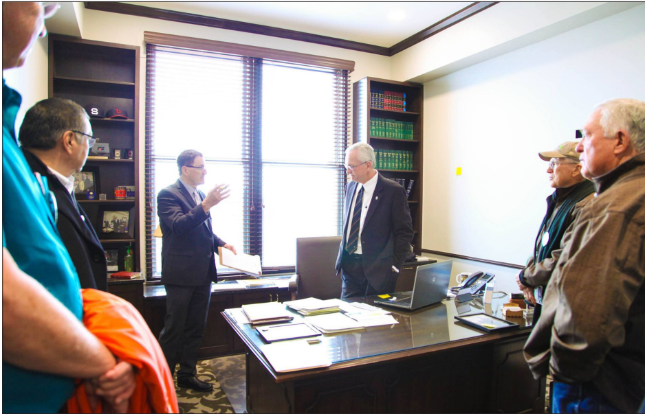
CKEC employees and directors speaking with Senator Darcy Jech, District 26.

Cooperative employees meet with legislative delegates.